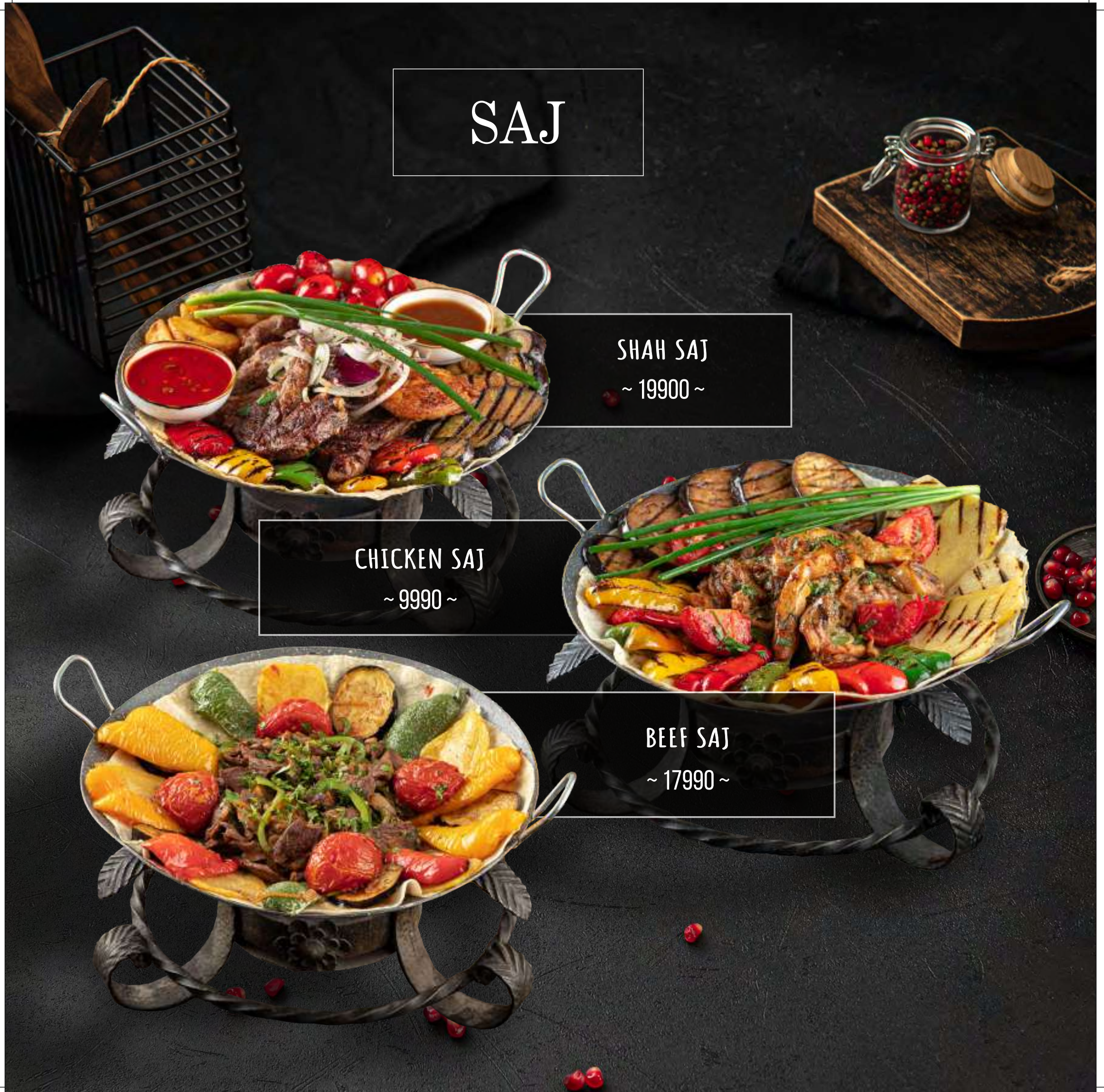
BEEF SAJ ~ 17990 ~