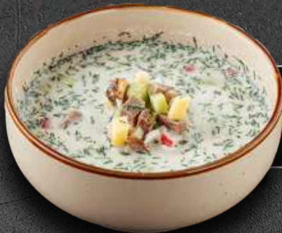
OKROSHKA ~ 1790 ~