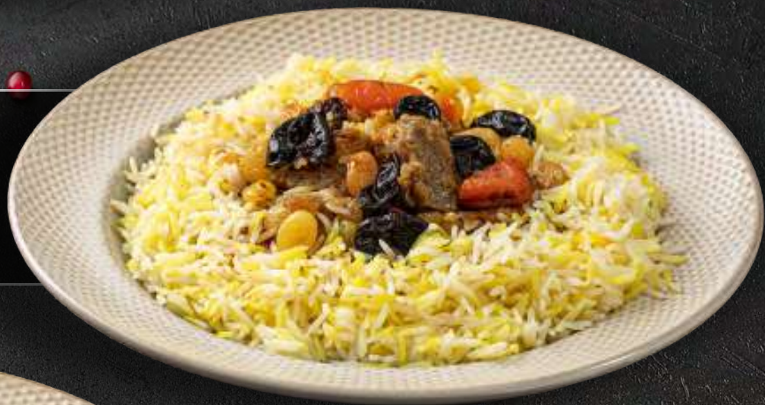
TURSHU PILAF TRADITIONAL LAMB AND DRIED FRUIT PILAF ~ 3290 ~