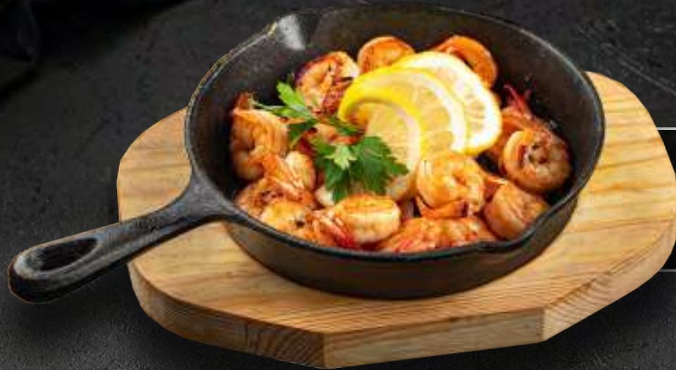
SHRIMP ON THE FRYER ~ 5590 ~