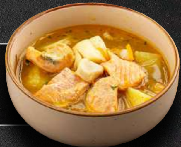
BAKU FISH BROTH FISH SOUP OF STURGEON, ATLANTIC SALMON AND PIKE PERCH ~ 2390 ~