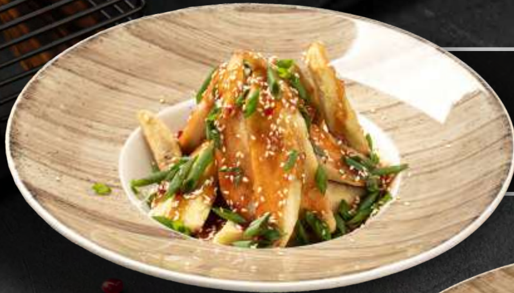
HYRT HYRT CRISPY EGGPLANTS WITH TOMATOES IN SWEET CHILI SAUCE