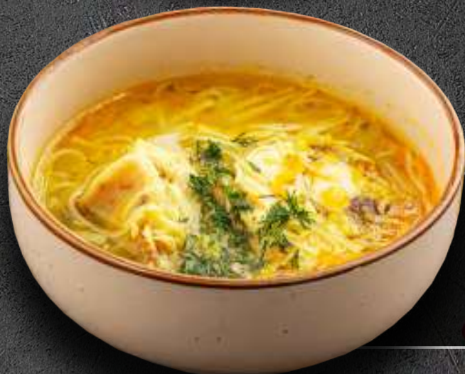
ARISHTA CHICKEN SOUP WITH HOMEMADE NOODLES ~ 1990 ~