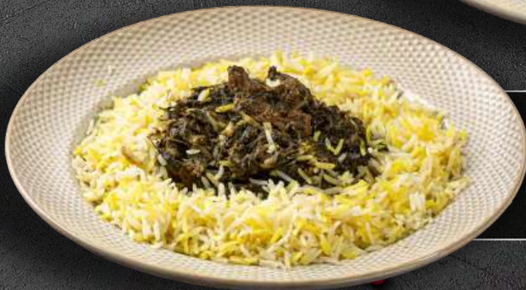
SABZI PILAF WITH STEWED LAMB AND HERBS ~ 2890 ~