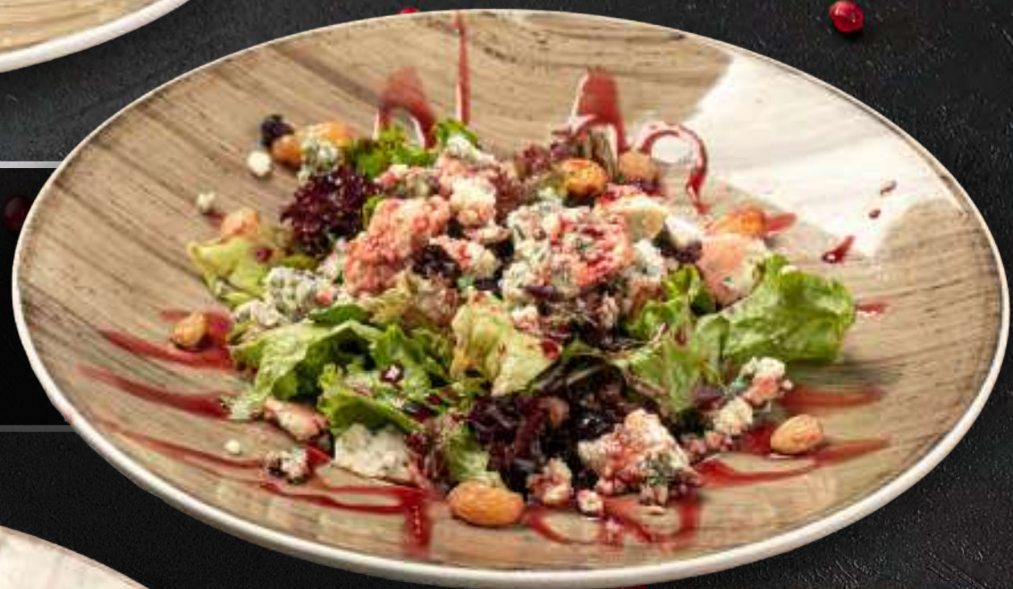
DREAMS OF SHAHZADEH

LIGHTLY SALTED SALMON WITH AVOCADO AND MIXED SALAD