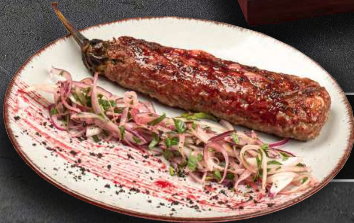
LULA KEBAB OF MUTTON WITH EGGPLANTS ~ 2490 ~