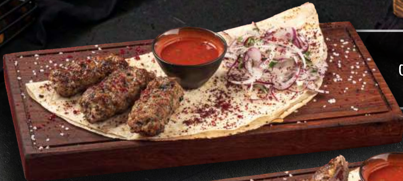
LULA KEBAB OF MUTTON WITH BASIL ~ 2490 ~