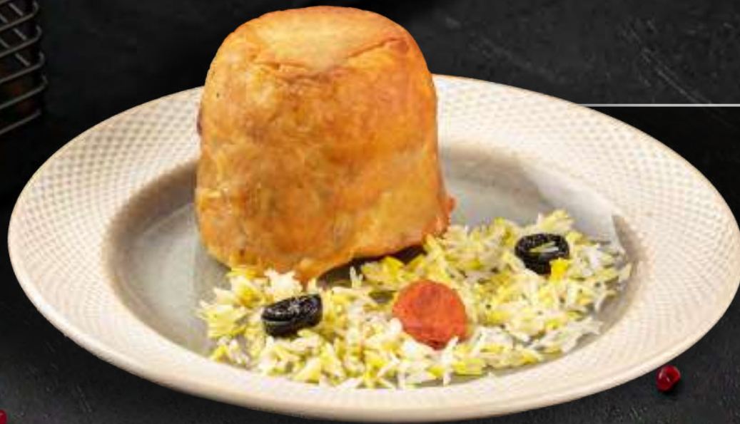
SHAH PILAF IN LAVASH ~ 2990 ~