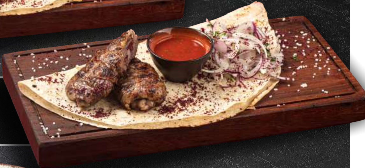
LULA KEBAB OF MUTTON WITH CHERRIES ~ 2490 ~